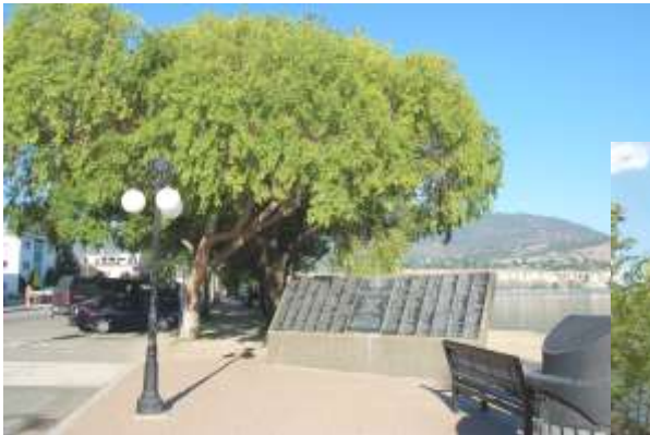
Okanagan Lake Promenade

The Kiwanis Club of Penticton is part of a world-wide service organization, Kiwanis International, made up of men and women who have the desire to become personally involved in making their communities better places in which to live.