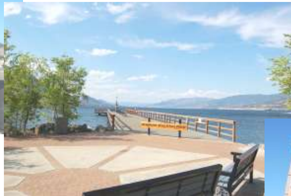
Kiwanis Walking Pier